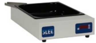
Tissue floating bath MWB

Please ask for other units for Histopathology and consumables as well as laminar flow equipment.