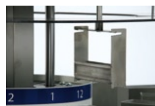
Transport basket for slides