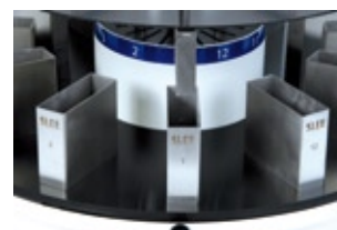
Cuvettes with transport basket