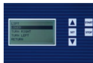
Ergonomic operating panel

(Specifications are subject to change without notice)