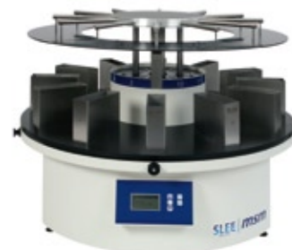
Stainer MSM for universal use

(Specifications are subject to change without notice)