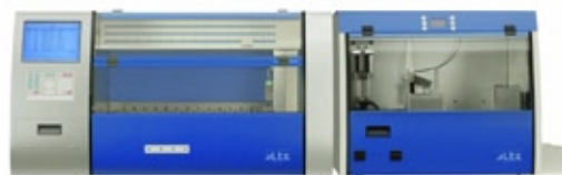
Stainer MAS in combination with Cover Slipper MCS

Please ask for other units for Histopathology and consumables as well as laminar flow equipment